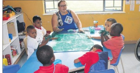
LEARNING: Youngsters being shown the value of feeling.