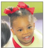
THERAPY: This three-year-old is undergoing her therapy treatment at Lusito School.

Besides celebrating Portuguese pride, the festival serves a greater purpose. Every year the profits made from the festival go to the Lusito Association, which manages the Lusito School. The school works with 80 learners who need special care. The cost of caring for a special-needs child is beyond the ability of many families. With funds raised from Lusito Land festivals, parents only need to pay R1 700 a month, while the school subsidises the remainder of the R5 500 monthly school fee.